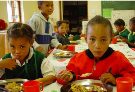
Ons sê "BAIE DANKIE liewe kinders van Zeist!"

n 2005 the Dutch school Zeister Schoolvereeniging celebrated its 75<sup>th</sup> anniversary.