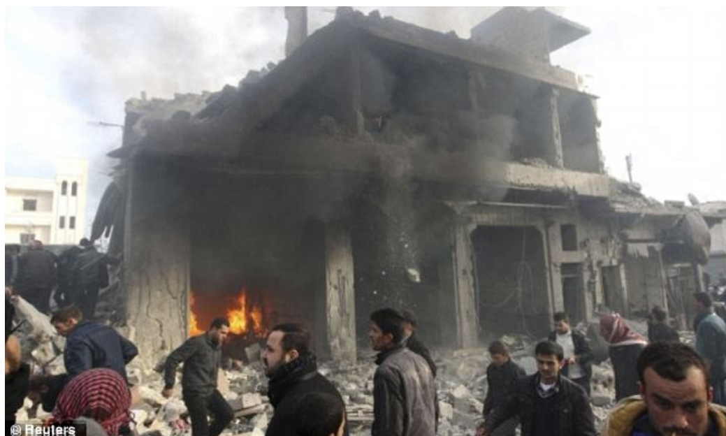
Devastation: People gather at a site hit by what activists said was missiles fired by a Syrian Air Force fighter jet from forces loyal to Assad, at the souk of Azaz, north of Aleppo on January 13

A leaked U.S. government cable revealed that the Syrian army more than likely had used chemical weapons during an attack in the city of Homs in December.