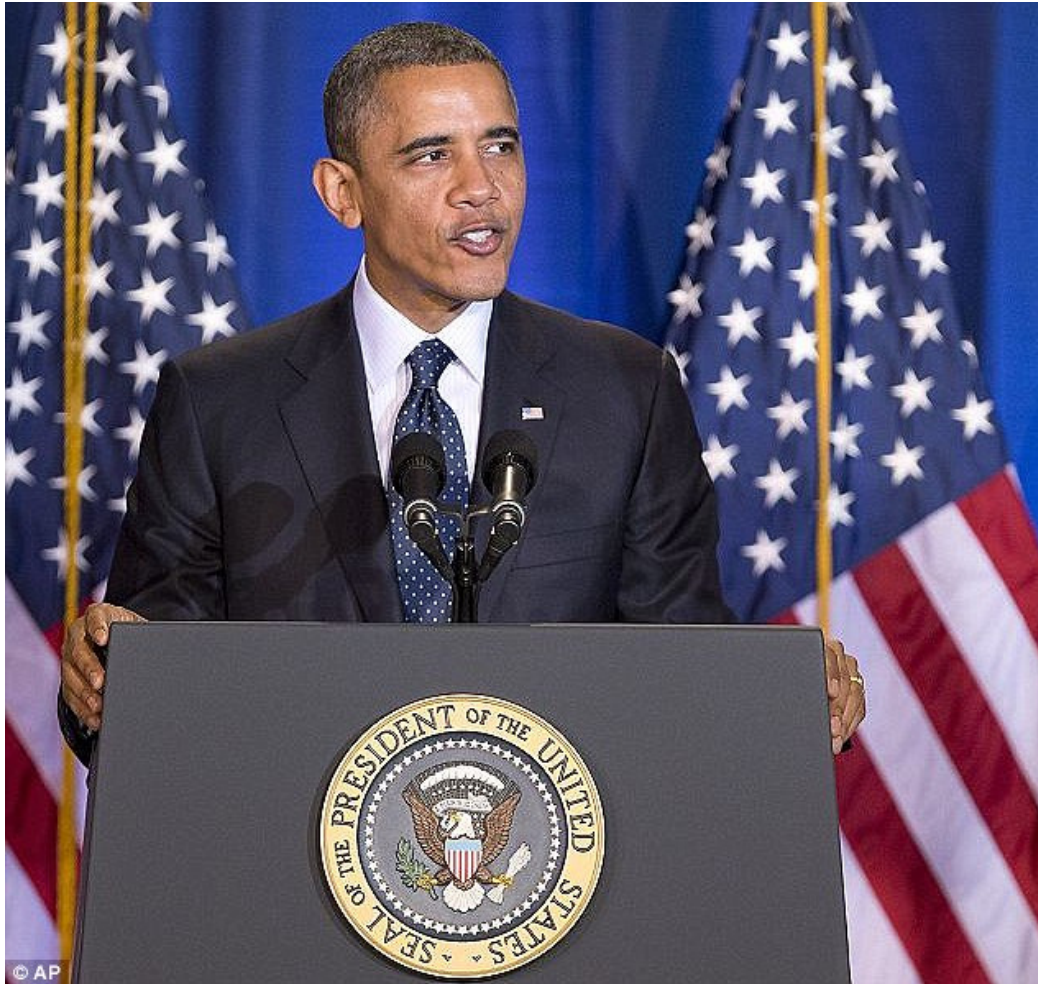
Threats: Barack Obama said during a speech last month that if Syria used chemical weapons against its own people it would be 'totally unacceptable'