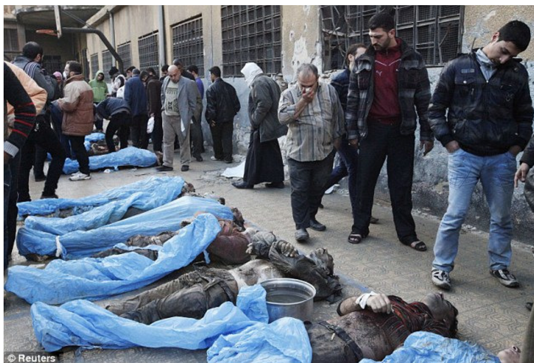
Countless losses: Families attempt to identify the bodies of Syrian fighters shot and dumped in a river in the northern Syrian city of Aleppo today