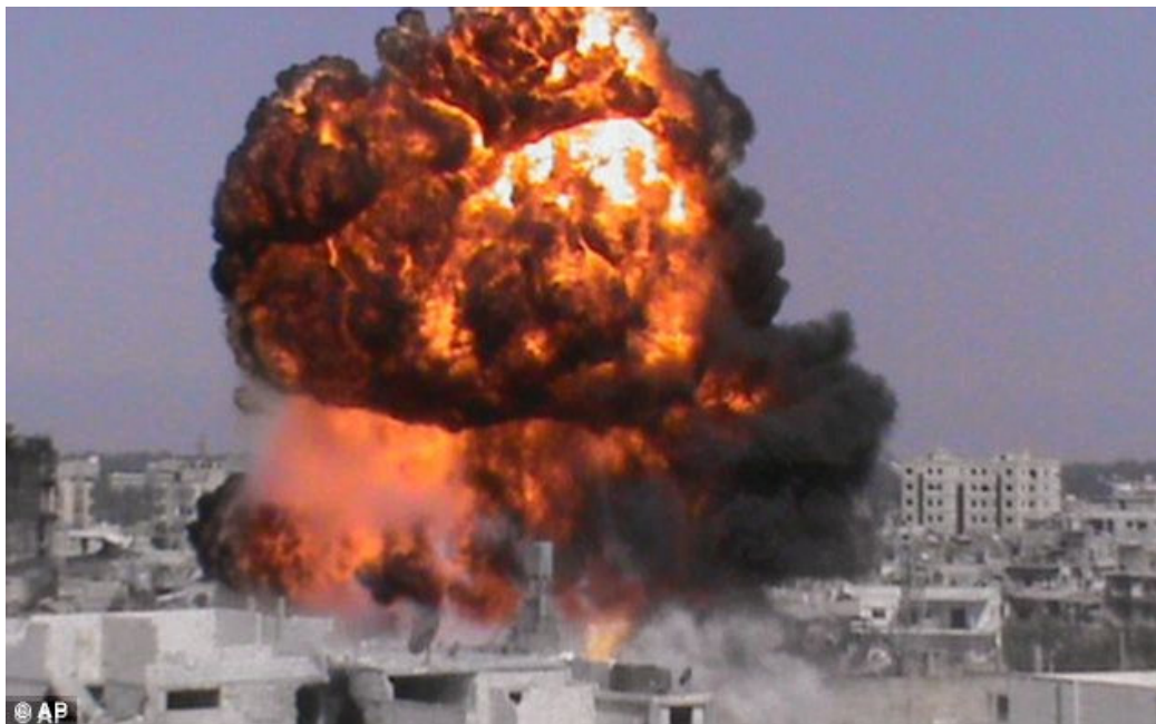
War games: An explosion in the Syrian city of Homs last month. It has been now been suggested that the U.S. backed the use of chemical weapons to spur international military intervention