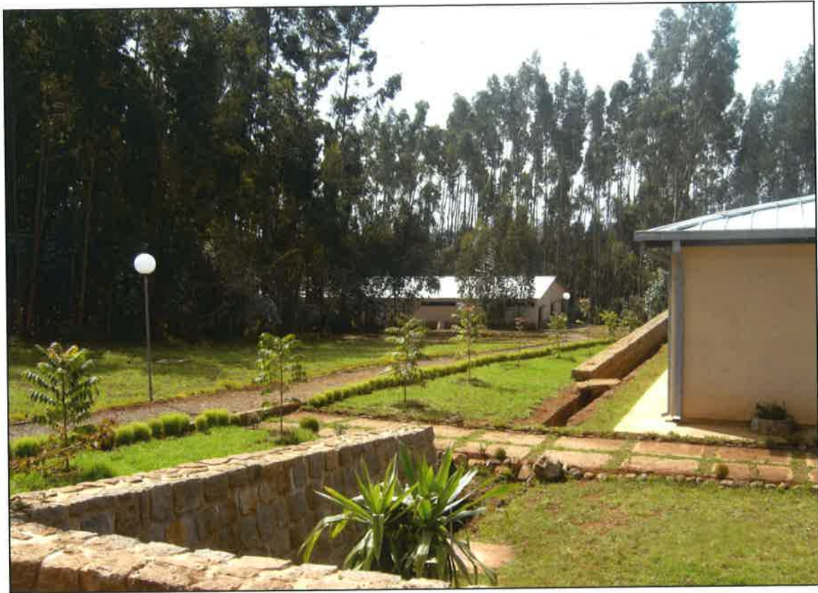
The occupational therapy block, in the background