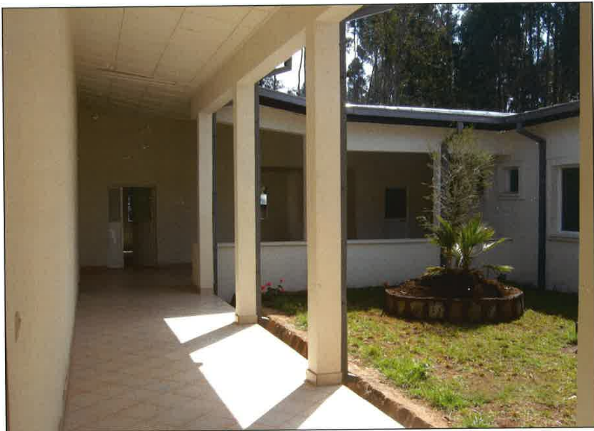
The New Clinic, inside