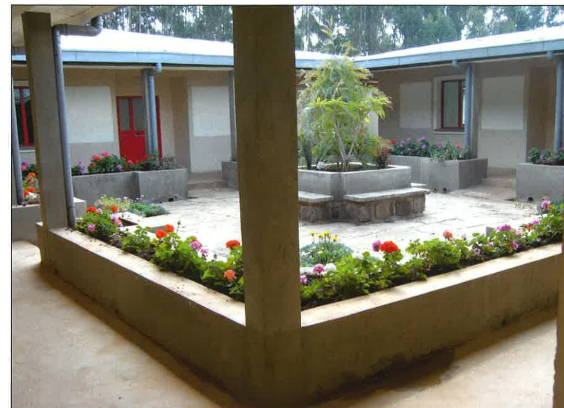
A Dormitory: the inner patio