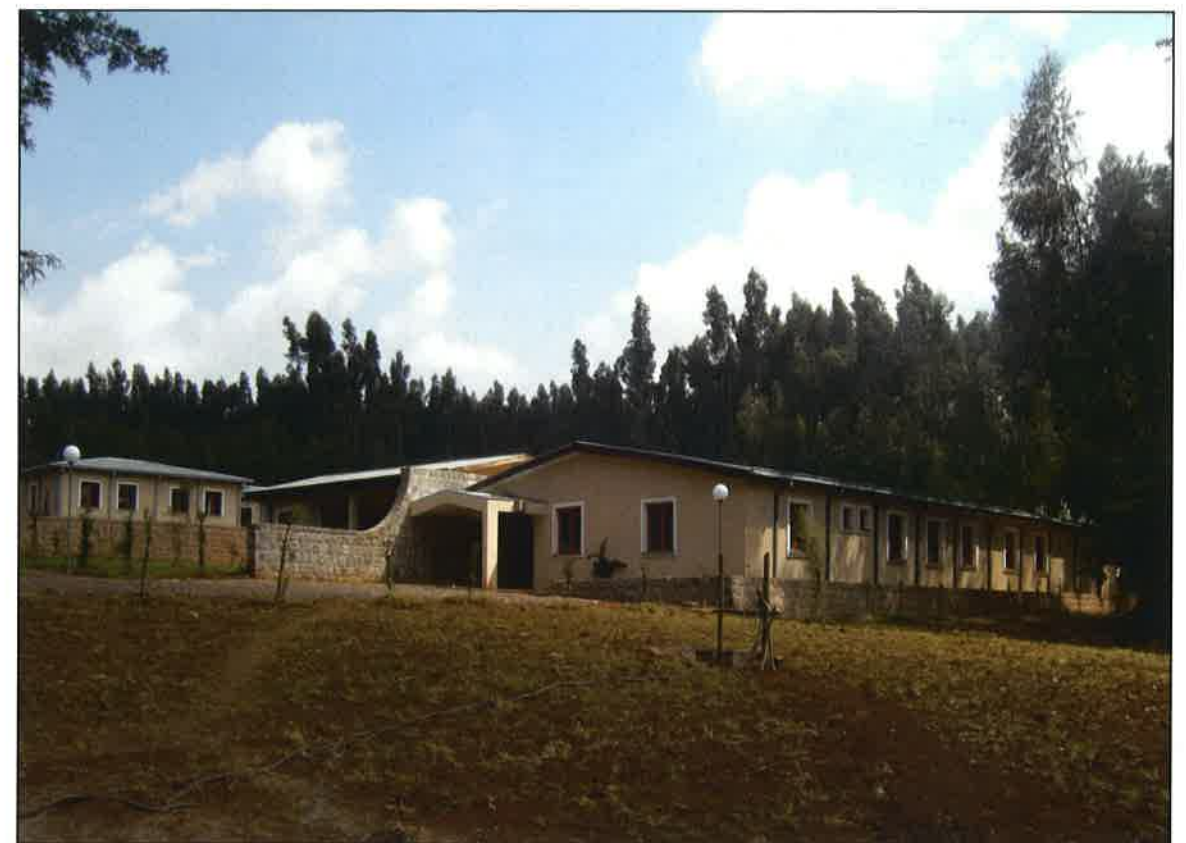
The New Clinic, Outside