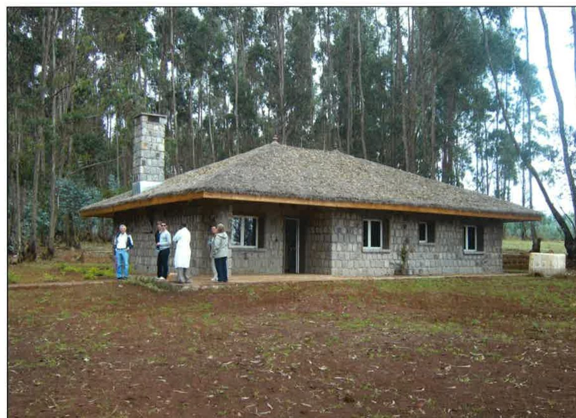
A Guest House