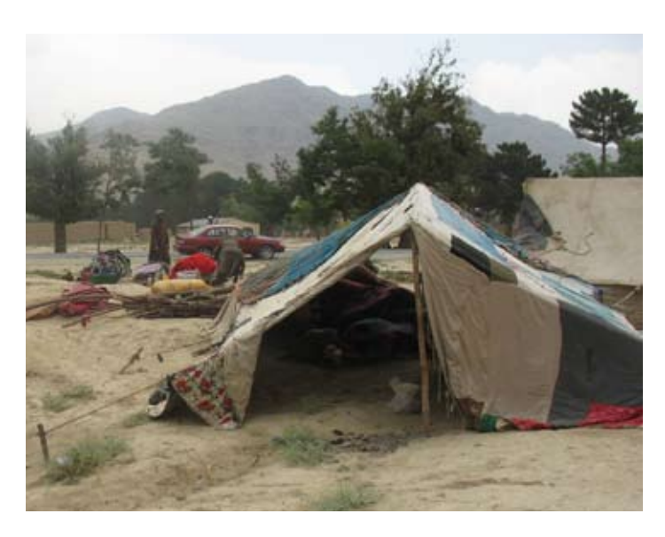
IDP camp in Kabul. Most of the dispaced here fled from Helmand province, the sight of still fierce fighting.

Some IDPs and refugees are able to take shelter with friends or family in safe areas, but many more are forced into formal or informal refugee camps across Afghanistan and in neighboring countries. With rising violence, these camps are increasingly overcrowded and under-resourced. Families living there for weeks or months at a time are focused on basic survival needs, unable to get adequate health care, education, work opportunities or other services they might need to rebuild their lives.