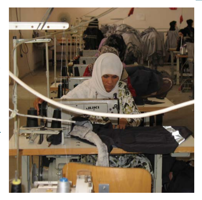
Sewing factory in Kunduz city where widows and female children can work to help their families.

CIVIC interviewed Ara, a woman whose husband and son were killed in a suicide attack in November 2007. Her husband ran a grocery shop where her son had also worked. The deaths were a traumatic experience: "When the blast happened, pieces of the flesh thrown from the blast landed in our yard. I ran down to [where the blast had happened] to see." Ara now faces a significant economic challenge: