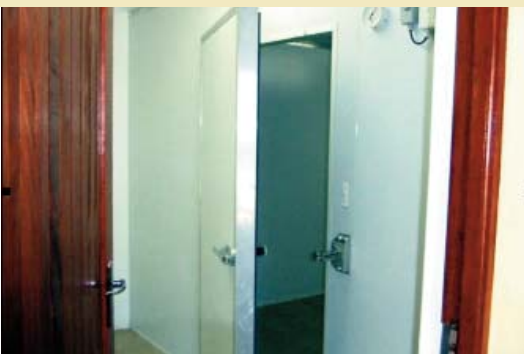
Double entrance to refrigerated facility