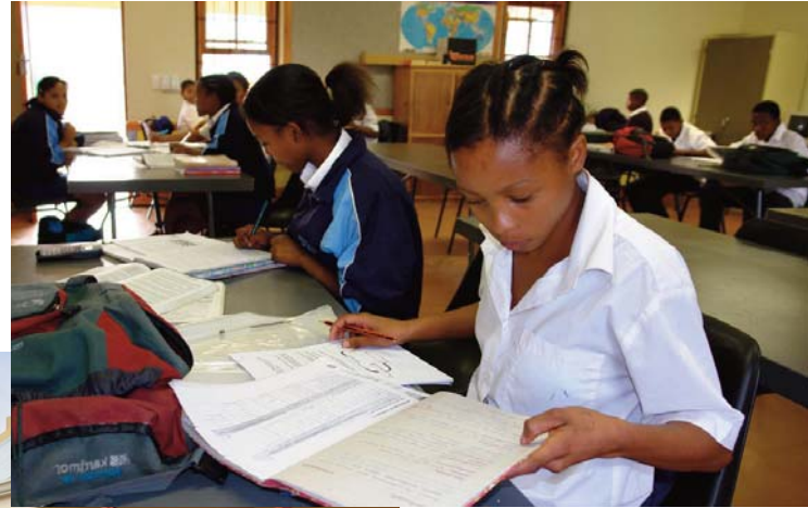
The after school homework class and its participants.

The building of an all weather paved basketball court will start within the near future.