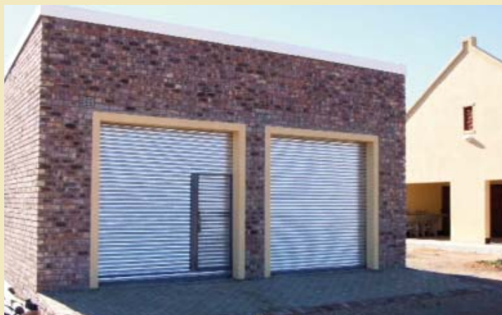
Double garage with security doors