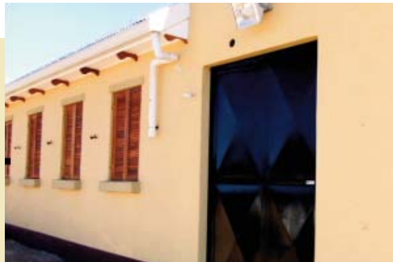
Cold & storage facilities - exterior security entrance