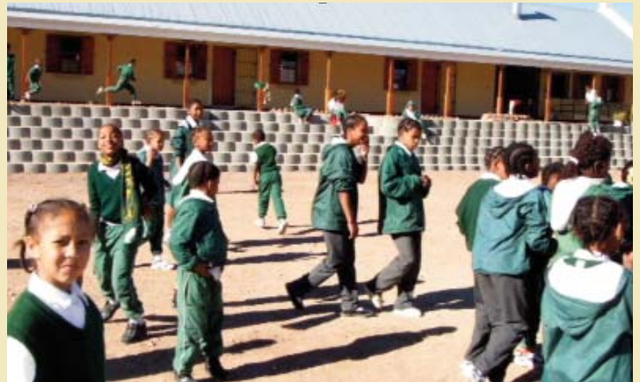
Class rooms and retaining wall