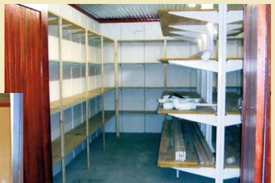
Partial interior storage facility